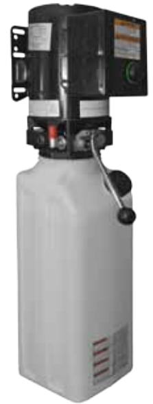
110V OR 220V