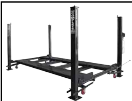
Portable With or Without Vehicle!