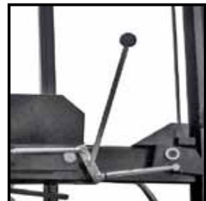
Single Point Lock Release