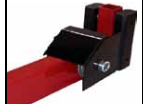
8 Oversize Rub Blocks to Minimize Friction & Wear